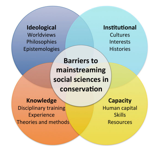
Figure 1. Barriers to mainstreaming the social sciences in conservation.

transformation of the entire approach, agenda, culture, and ethos of the conservation community.