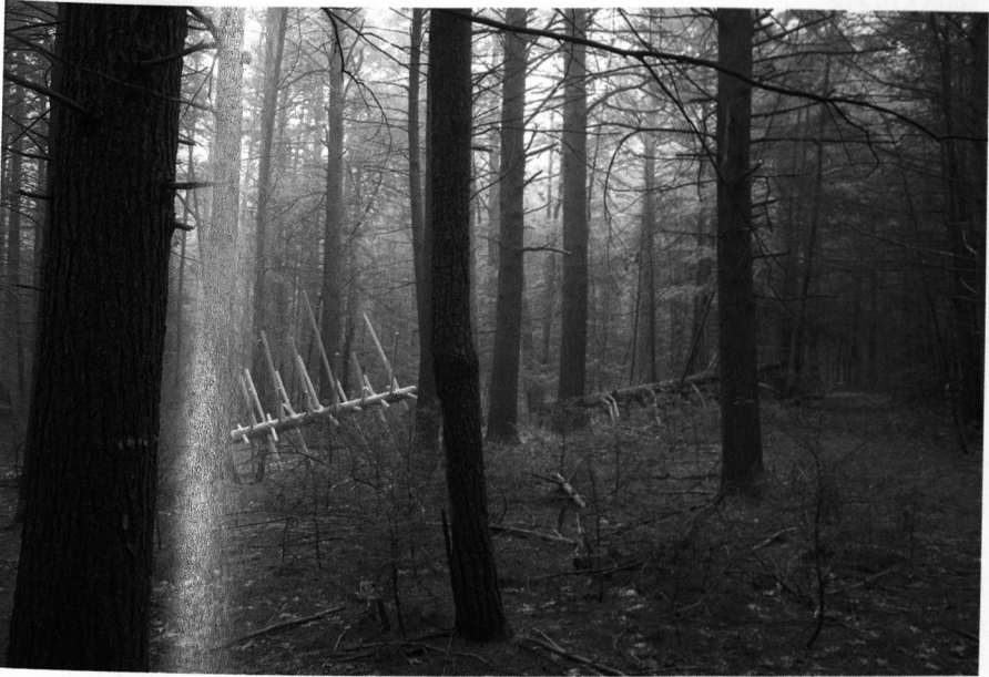
Fig. 11.2 Exchange Tree , one of eighteen Hemlock Hospice field installations at Harvard Forest that highlights the death and disappearance of eastern hemlock trees from North America due to invasive insects. 8×10×12.5 feet. Wood and acrylic paint. 2017. Collaborators: David Buckley Borden, Aaron Ellison, Salvador Jiménez-Flores, and Saluo Rivero. Additional works and information at https://harvardforest.fas.harvard.edu/hemlock-hospice .

fostering social cohesion around ecological issues. The exhibit was featured in the Boston Globe , Living on Earth , Orion , and SciArt Magazine ; in addition to leading guided tours of the installation, the creators have given dozens of presentations at universities, galleries, and conferences. Visitors' written responses to the sculptures in the field provided long-term data now being analyzed.